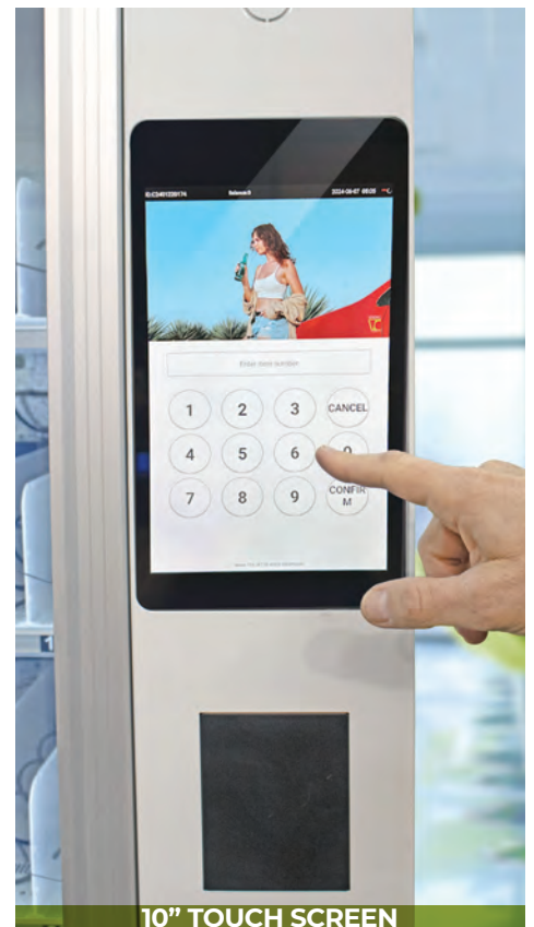
10" TOUCH SCREEN