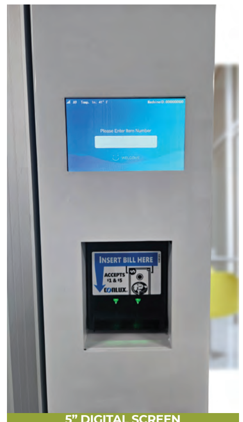
5" DIGITAL SCREEN