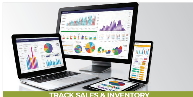
TRACK SALES & INVENTORY