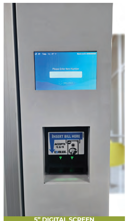
5" DIGITAL SCREEN