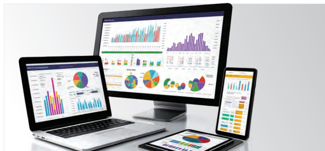
TRACK SALES & INVENTORY