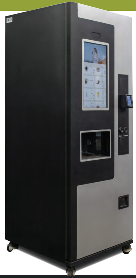
VC CF7N-22 Gray

With a bean capacity of 2.5 lbs. and 24 lbs. of powdered ingredients divided across six canisters (4 lbs. each), this machine is designed to streamline operations and enhance efficiency for your service team. It can hold and dispense up to 140 - 12 oz. cups, along with an equal quantity of lids, ensuring a smooth and satisfying customer experience. For optimal performance, the self-cleaning modular system should be used daily or at each service interval.