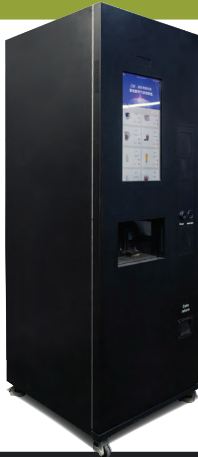
VC CF7N-22 Black