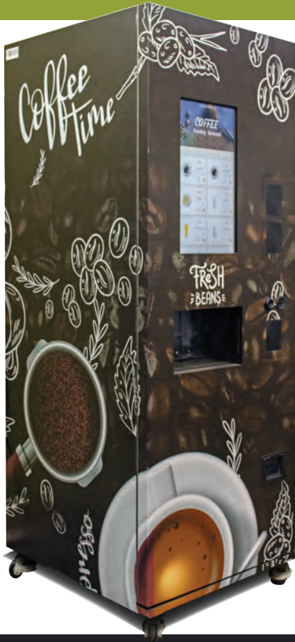
VC CF7N-22 Fresh Beans