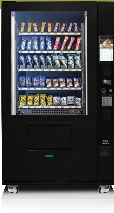
VC FEL9-10 Ice Cream