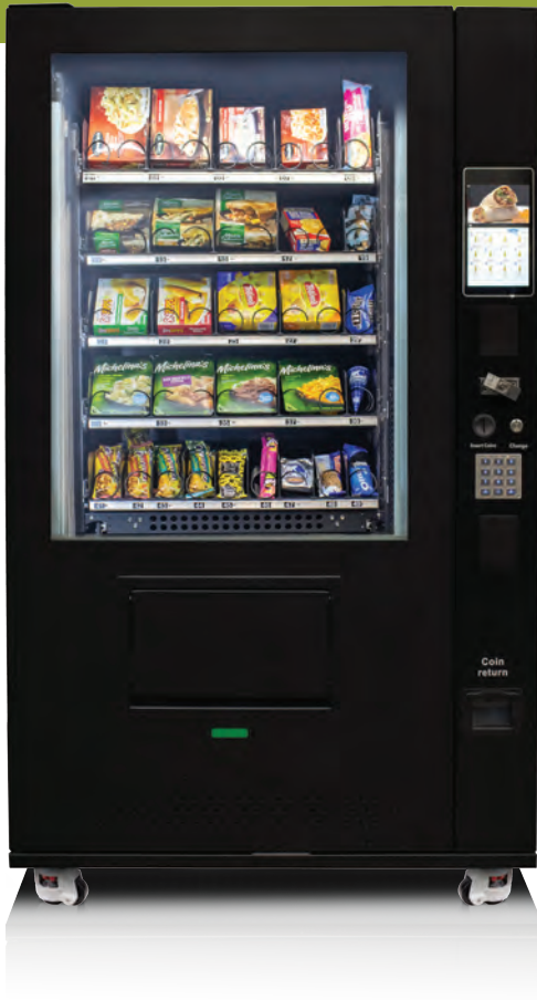
VC FEL9-10 F1