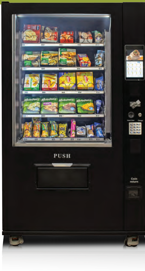
VC FSC9-10 F2